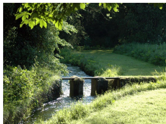
Hatches close to top of Beat 2