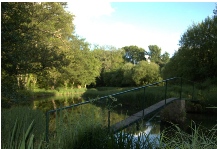
Venice Bridge looking onto Beat 3

The beat ends just above the first bridge, which we call Venice Bridge which you may cross over to fish the final 50 yards.