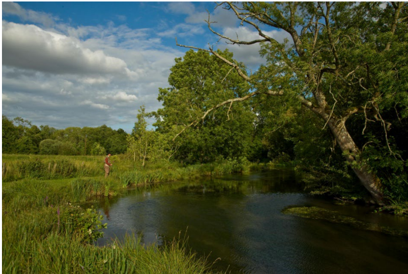
Ash Tree Corner

Looking upstream, all the fishing is on the left bank. Be careful as you cross the bridge; there are fish right under your feet as you cross. Between this bridge and the next bridge is a prime section of shallow water where fish are easy to spot. The first fifty yards or so after the second bridge are nothing much, but once you reach the tussocks go carefully. This bank is very spongy and all the fish lie in the undercut of your bank. We call this grayling alley, which takes you to the excellent Ash Tree corner though