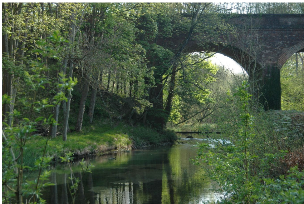
Viaduct. Fish on left and cross bridge to right

We don't manage this in any real sense and you are close to the road but it can be fun.