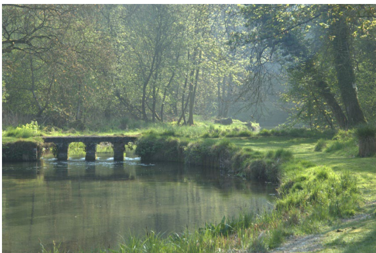
Top hatches. Crossing to left bank and eventually viaduct.

After the first hatches cross to the right bank where casting is tricky until you reach the footpath bridge. Please note we have recently installed gates and fencing to keep walkers on the footpath and away from the riverbank. Go straight through the gates; they are not locked. Beyond the gates the beat curves right and is fairly open until you reach the second, and top, hatch pool.