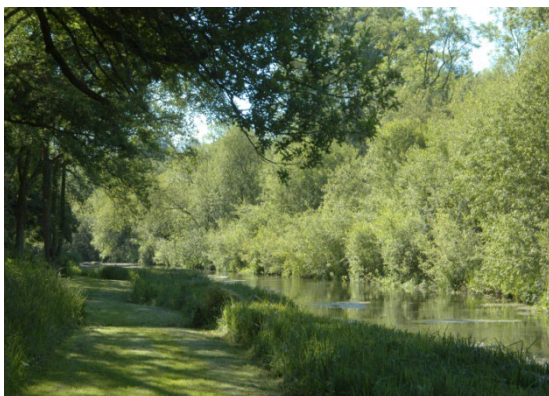
View upstream from start of Beat 2

stile, across the road and over another stile, some walk boards and back to the river. Immediately there is another pool (tricky to cast) and then on up to the pool immediately below the Mill Race. You are now back at the Cabin and the end of the beat.